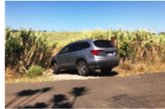
Entrada principal a la finca