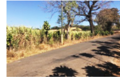
Frente de propiedad